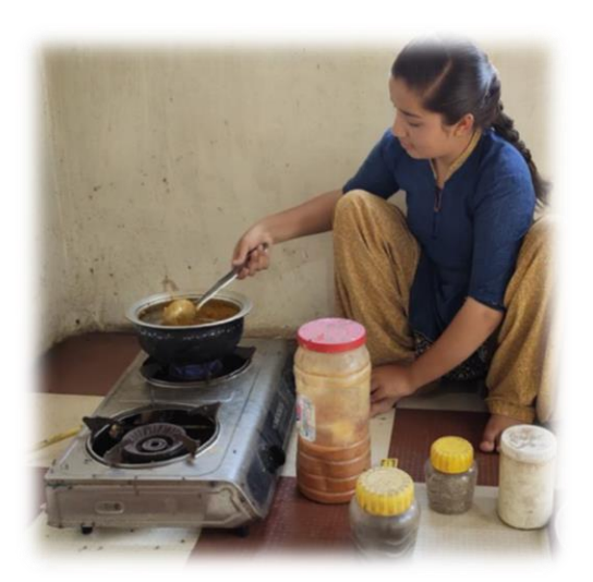
Biogas Support to 100 Farmers by Linkages through DRDA