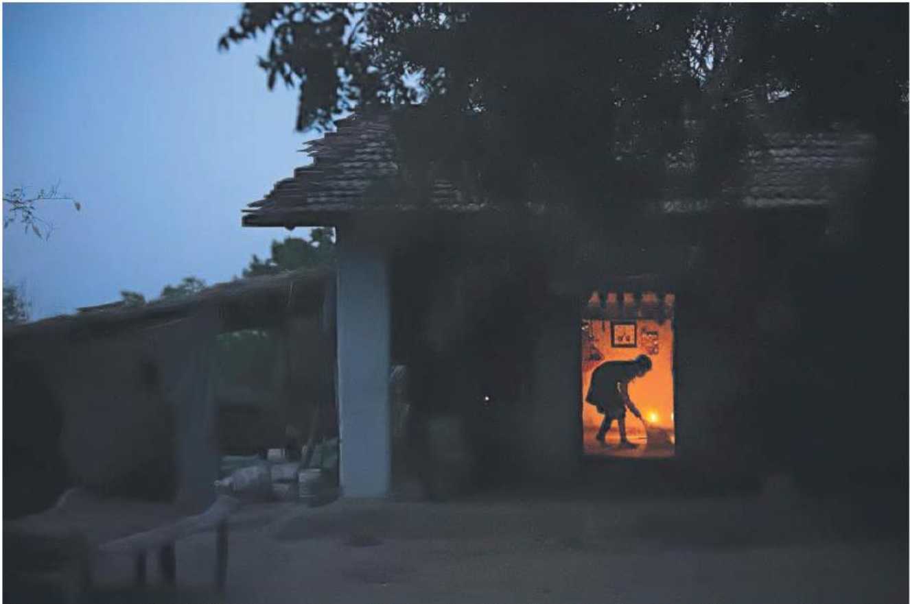
A house on the islet of Vali Tapu on Kanewal Lake, where 55 villagers live in mud-brick homes without electricity